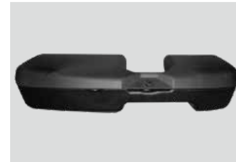
Front Accessory Box