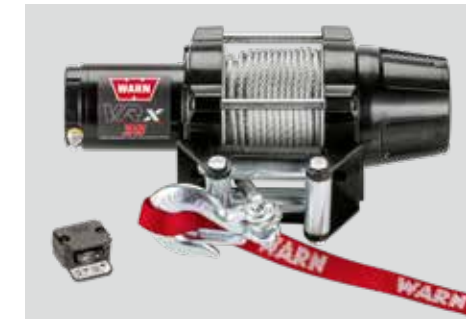
WARN VRX 2,500 lbs Winch