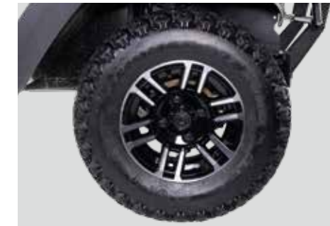
Alloy Wheel with ATV or HDWS Tyre (Optional)