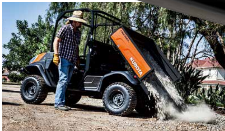
*Photo with factory installed Spray-on Bedliner option.

*Manual dumping on RTV-X900 General Purpose model.